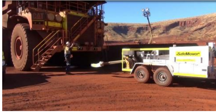
Almost in Position