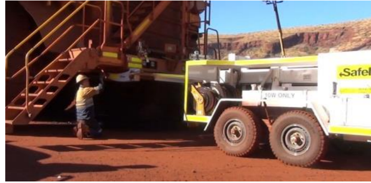
Inserting Connection Pins