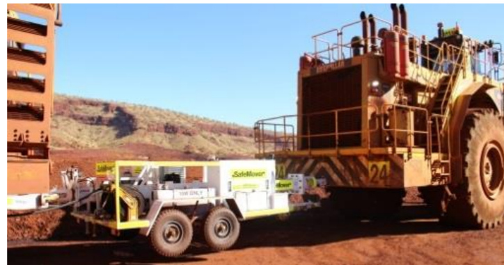
On the Move